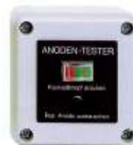
Board for anode's check

This board checks the magnesium anodes' status and it works without any external electrical supply.